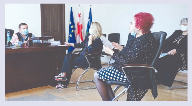
MEETING IN TERJOLA MUNICIPALITY