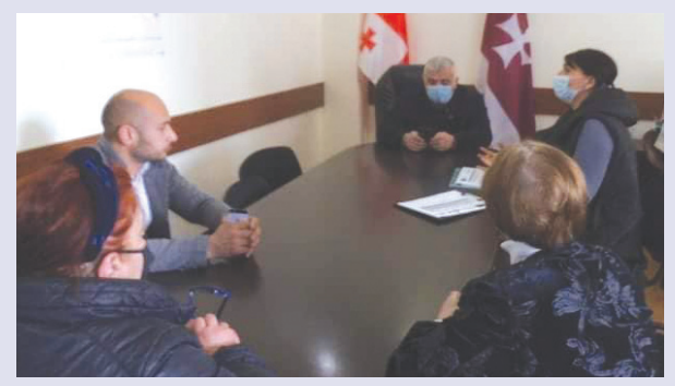
MEETING IN OZURGETI MUNICIPALITY